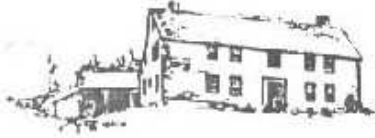
Strong-Porter House (c. 1730)