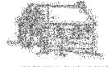
Brick School (c. 1885)