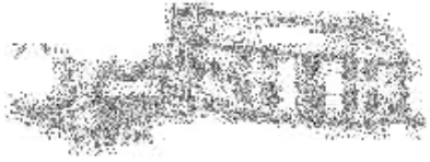
Strong-Porter House (c. 1930)